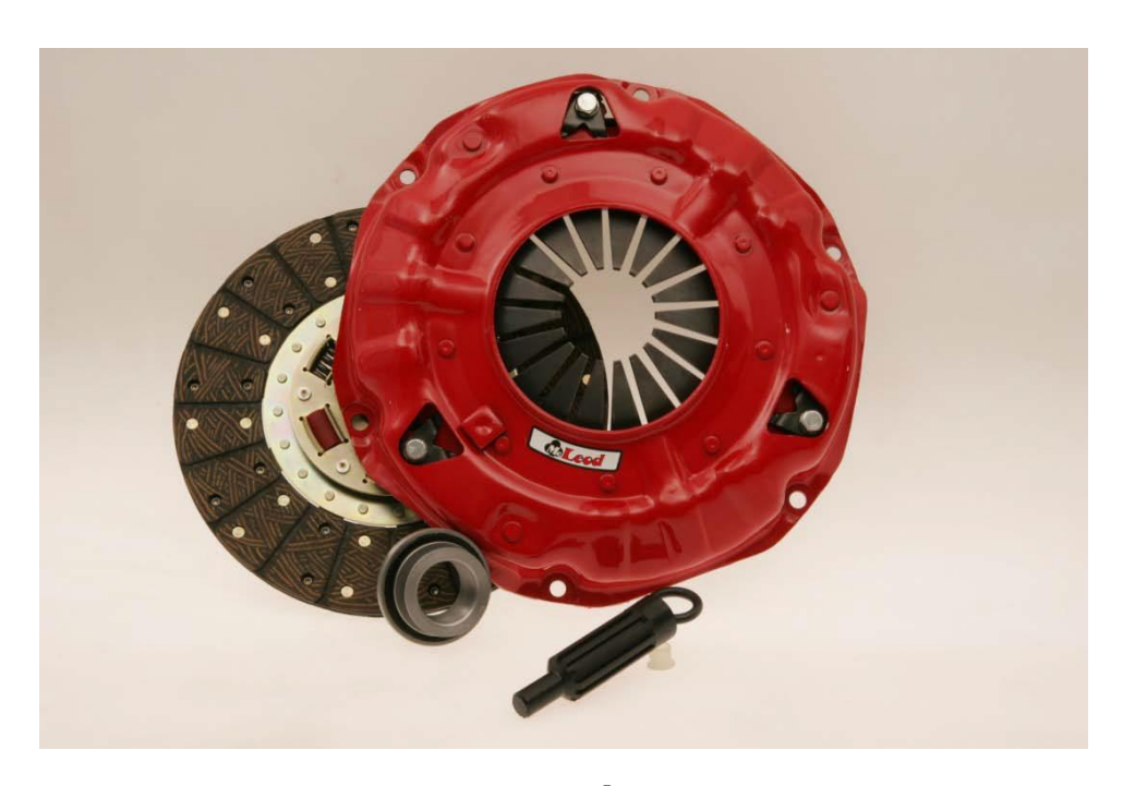
Street Pro Shown

to date instructions for your McLeod Product.