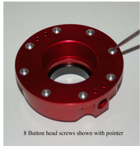
Slip-On Style Bearing Shown Figure 2

Step 3 If you are disassembling a Slip-On style bearing you will need to remove the 8 screws from the bottom of the bearing assembly to disassemble the unit. See Fig 2