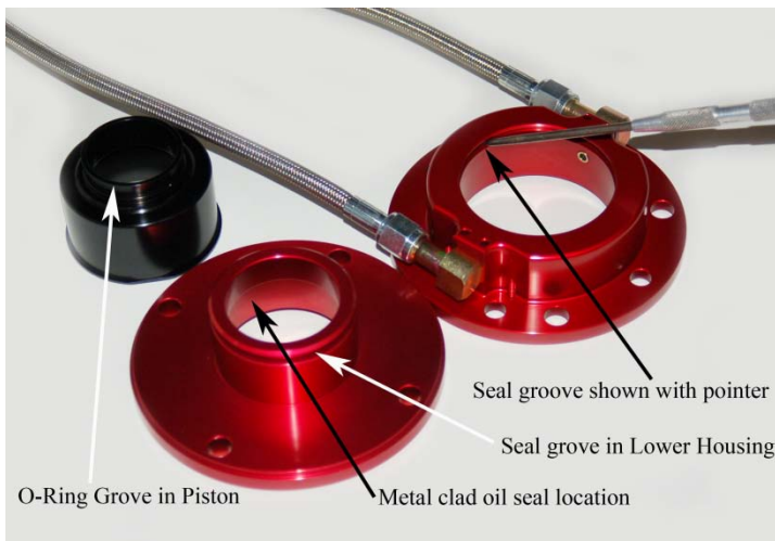
Figure 5 Bolt-On Bearing Shown

Step 7 Remove metal clad oil seal from center of Lower Housing. Note location of seal depth , some are all the way down to the step in the housing, some are 1/16" down and some flush with the top of the bore. Make a note for you to reference when reinstalling the seal. You can use a socket with a 1-3/4" OD to drive the seal out of the housing from the upper side. Gently tap the seal out. Remove Quad seal from OD of Lower Housing.